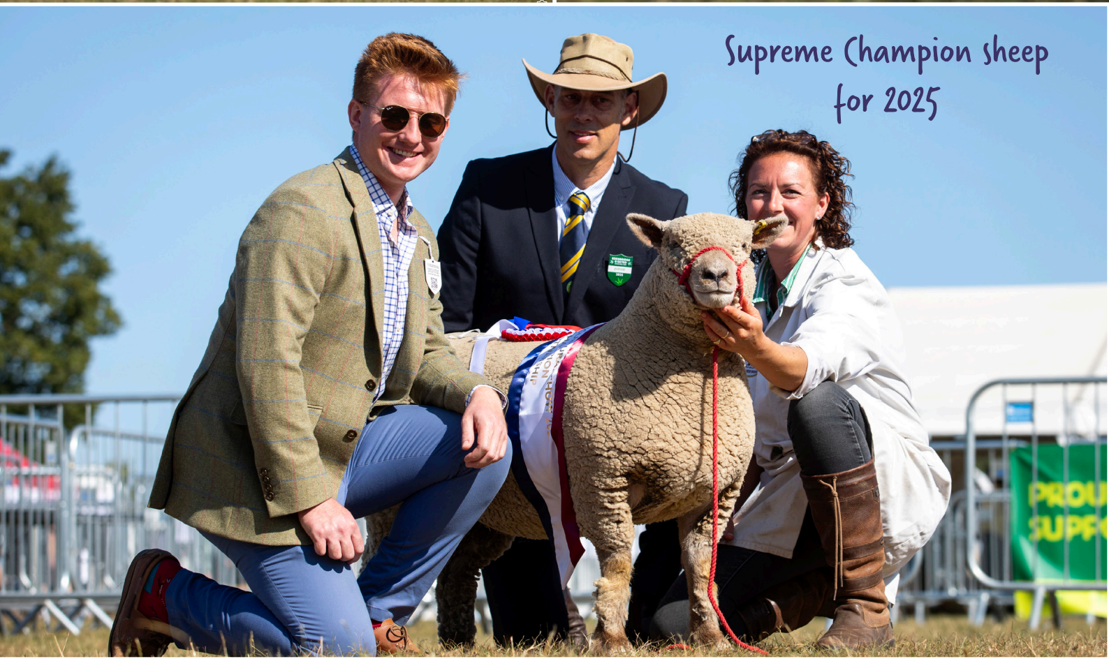
Supreme Champion sheep for 2025